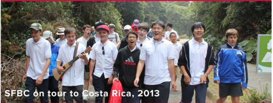
SFBC on tour to Costa Rica, 2013

Celebrating your long history of sharing music with the Bay Area and beyond!