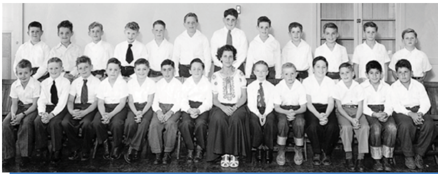
The original 29-member San Francisco Opera Boys Chorus photographed in its founding year of 1948.