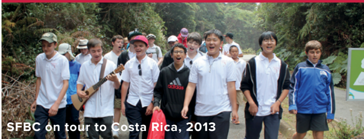
SFBC on tour to Costa Rica, 2013

Celebrating your long history of sharing music with the Bay Area and beyond!